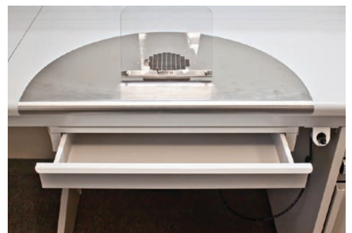
Our unique downdraft module integrates dust collection into your worksurface.