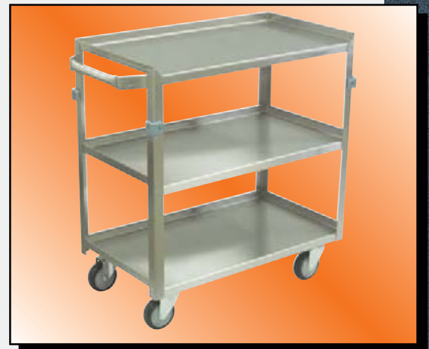
Model ZJ Shown