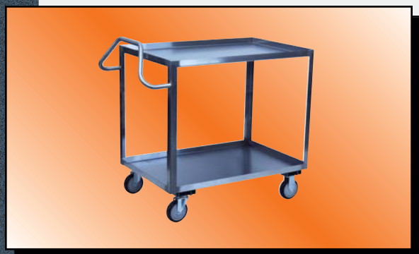
Model XS Shown