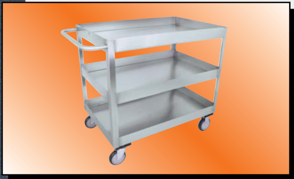
Model YU Shown