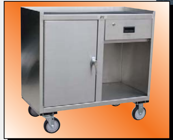
Model YX Shown