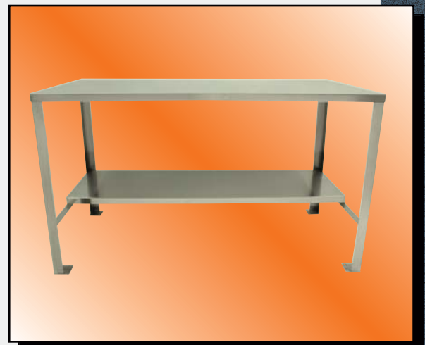
Model YE Shown