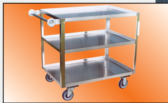
Model XJ Shown