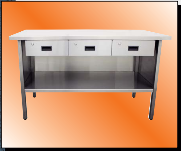
Model VO Shown