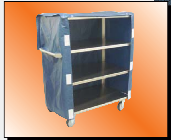
Model ZL Shown