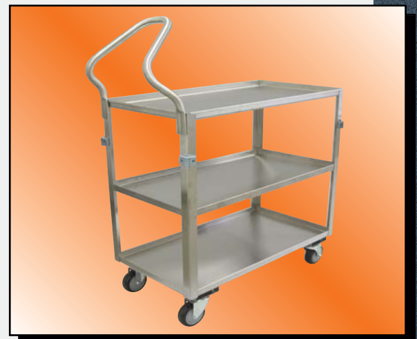
Model ZK Shown