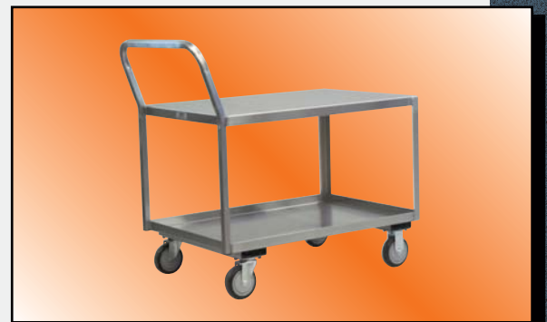
Model XL Shown