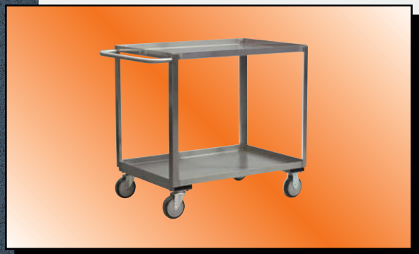
Model XB Shown