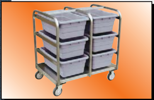
Model YA Shown