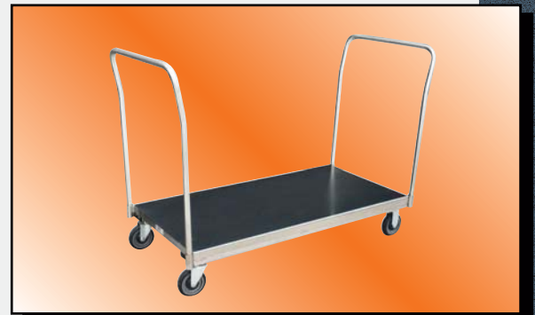
Model YP Shown