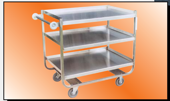
Model XN Shown

1,200 LB CAP.*(*800 lb with thermorubber casters)