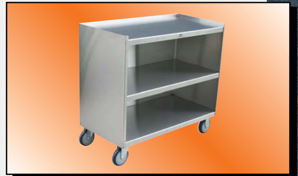
Model YC Shown