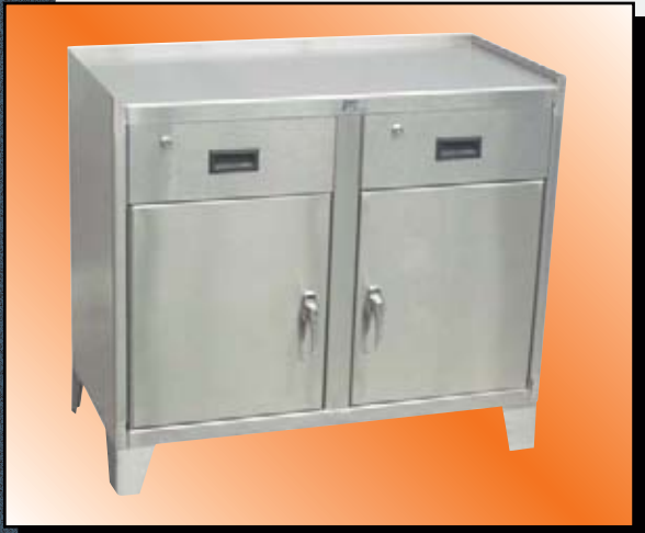
Model ZU Shown