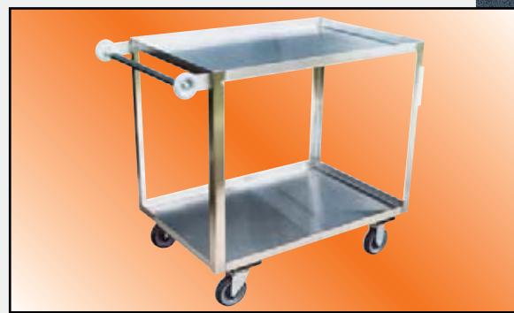
Model XH Shown