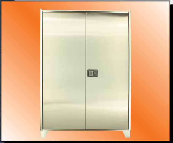
Model KW Shown