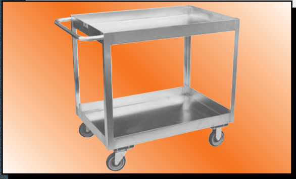
Model XZ Shown