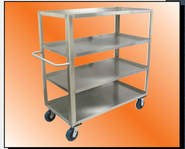
Model XD Shown