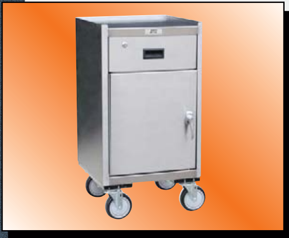
Model YS Shown