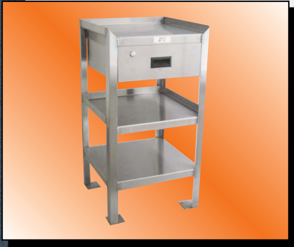
Model XU Shown