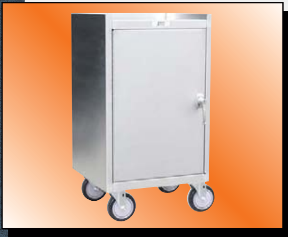
Model YT Shown