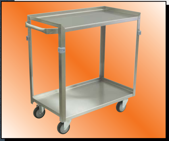
Model ZF Shown