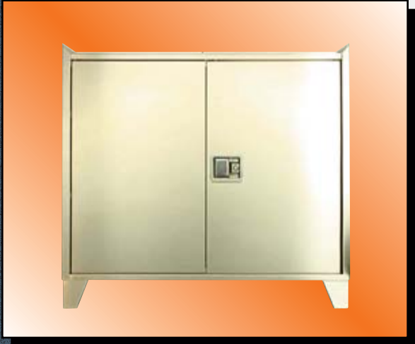
Model KU Shown