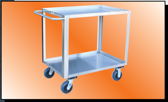
Model YJ Shown