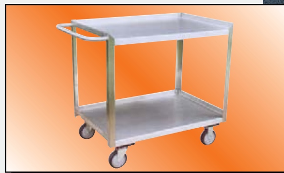
Model XK Shown