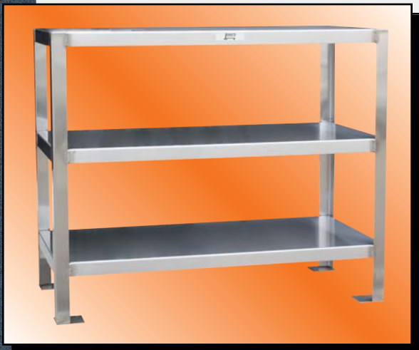
Model YG Shown