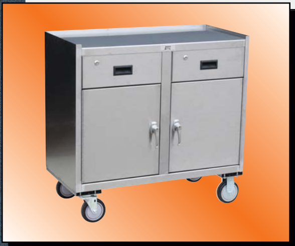
Model YV Shown