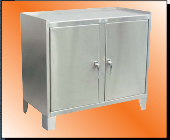
Model ZP Shown