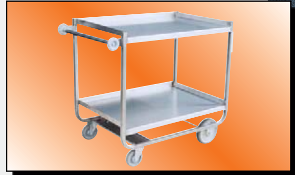
Model XF Shown

1,200 LB CAP.*(*800 lb with thermorubber casters)