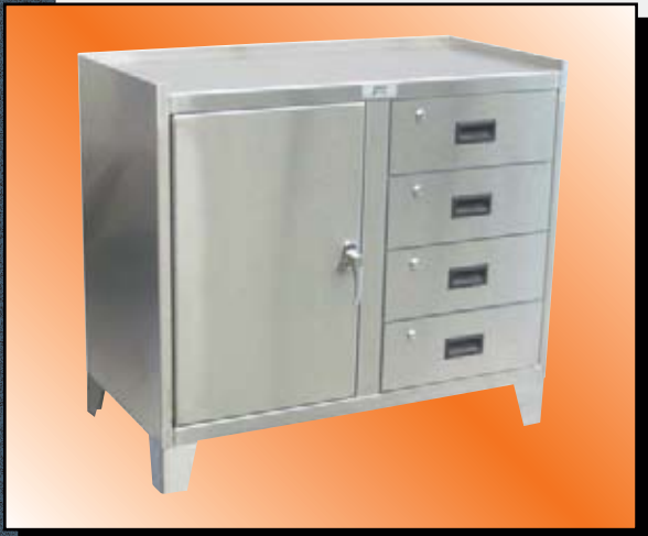
Model ZV Shown