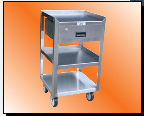
Model XR Shown