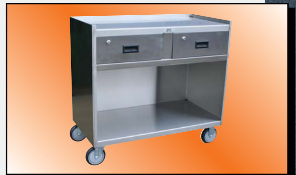
Model YK Shown