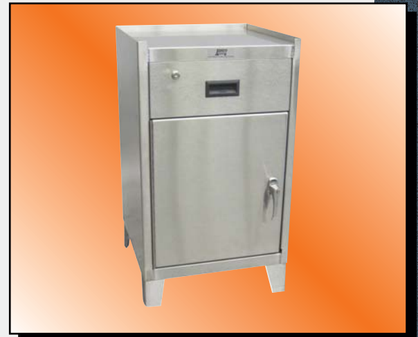
Model VX Shown