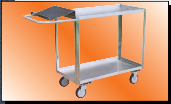
Model XO Shown