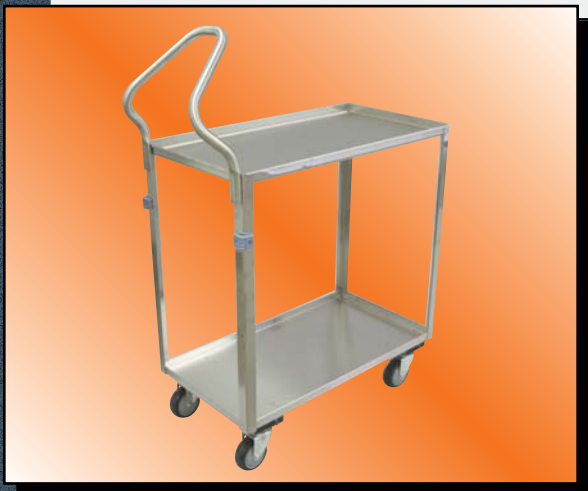
Model ZG Shown