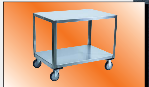
Model YB Shown