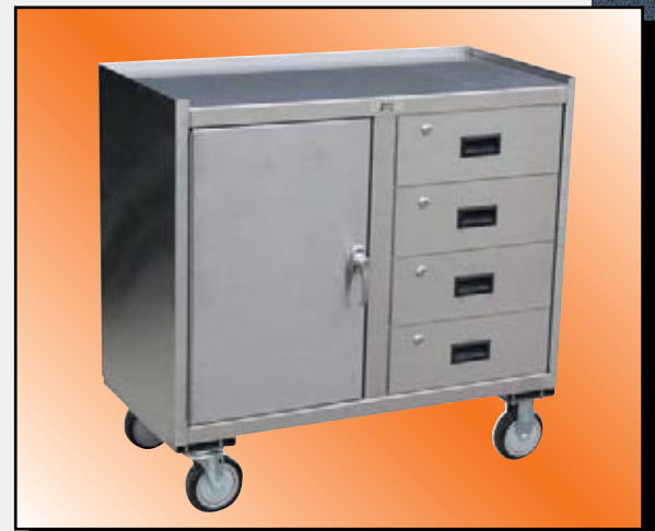
Model YY Shown