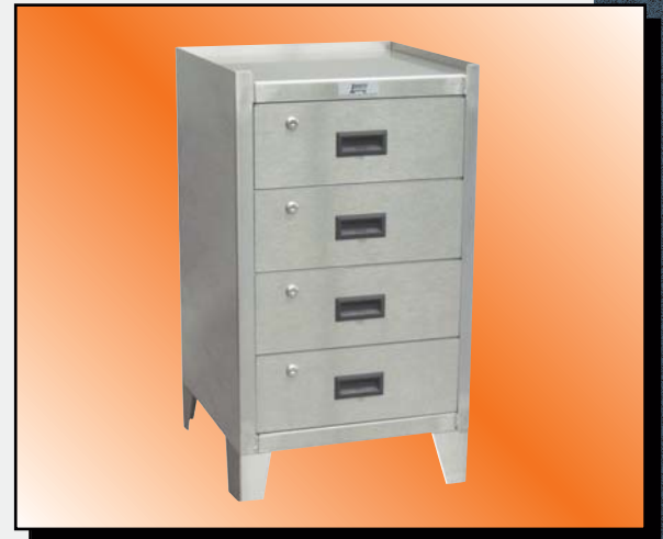
Model VW Shown