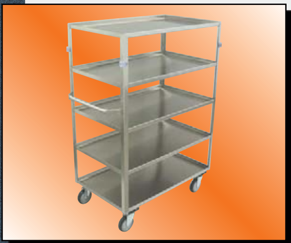
Model ZY Shown