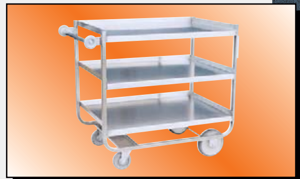
Model XG Shown

1,200 LB CAP.*(*800 lb with thermorubber casters)