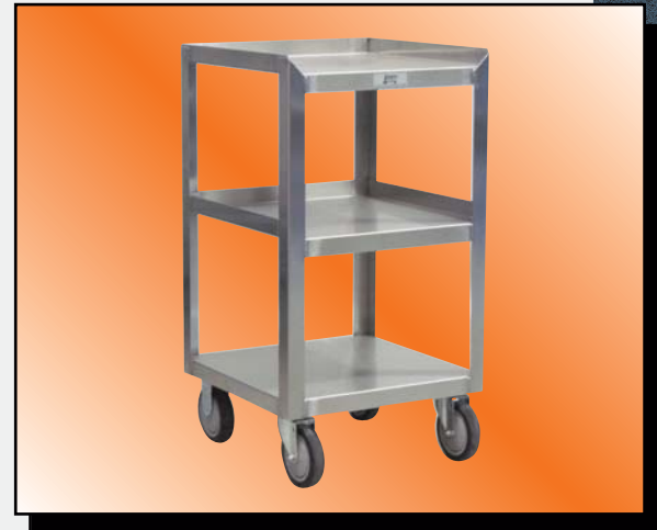
Model XX Shown