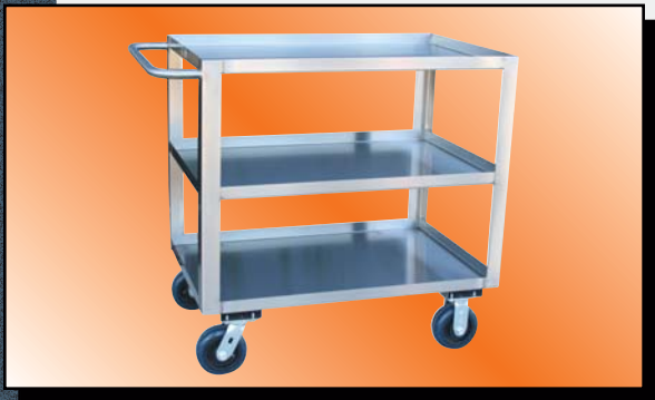
Model YN Shown