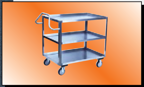
Model XT Shown