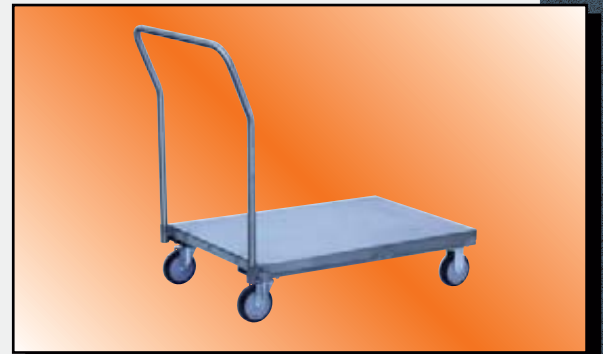
Model XP Shown