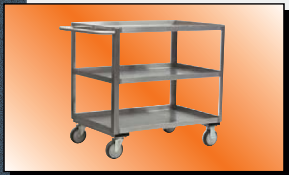
Model XA Shown