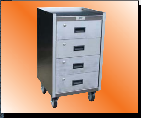
Model YF Shown