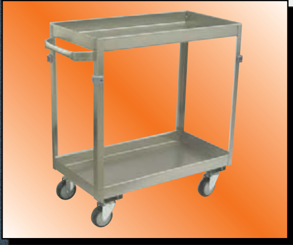
Model ZM Shown

BOXED TO SHIP FED EX GROUND Note: 22" x 48" Ship Freight