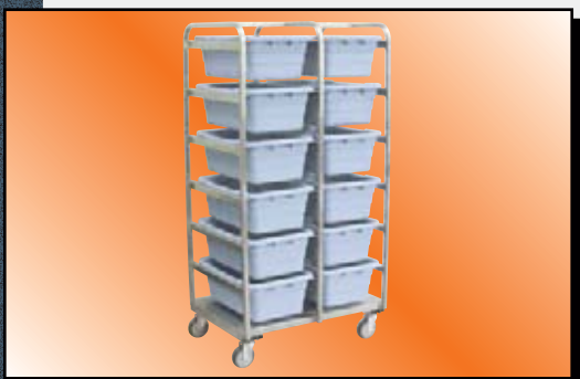
Model YQ Shown