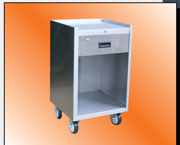
Model YD Shown