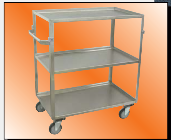
Model ZW Shown