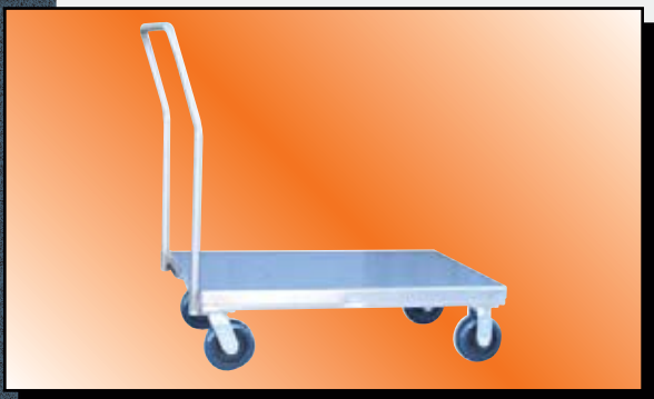
Model YL Shown