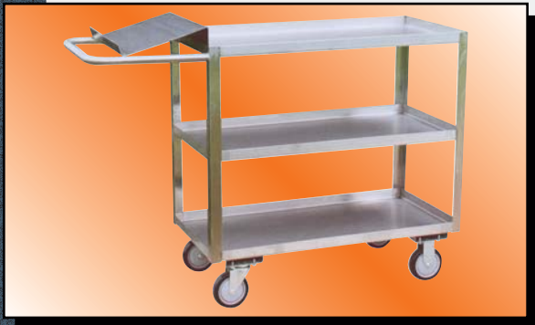
Model YO Shown