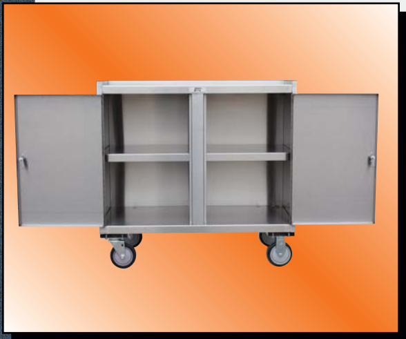
Model YZ Shown