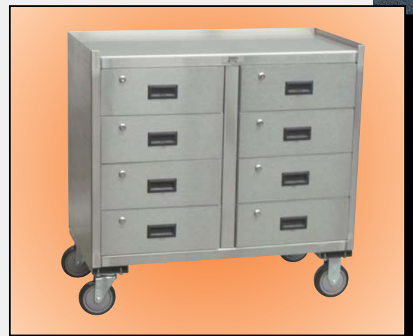
Model ZO Shown