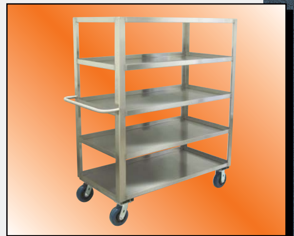
Model XE Shown