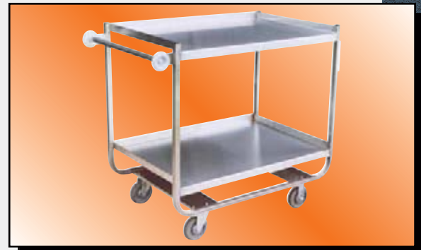
Model XM Shown

1,200 LB CAP.*(*800 lb with thermorubber casters)