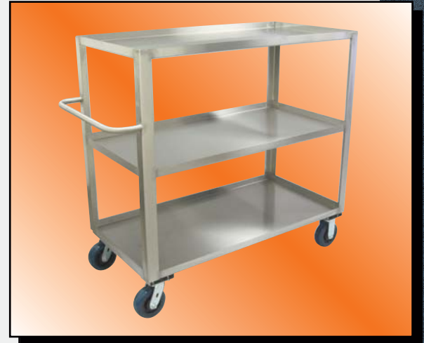
Model XC Shown