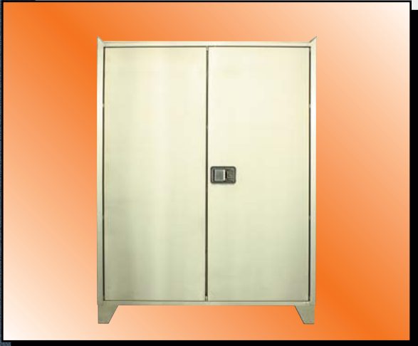
Model KV Shown