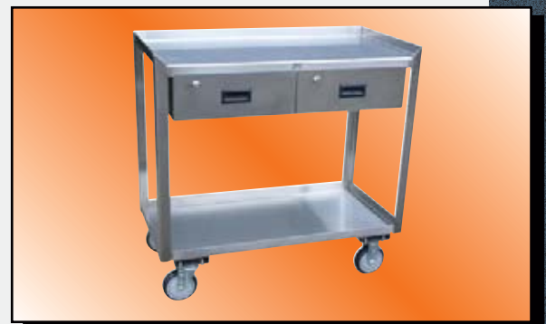
Model YR Shown