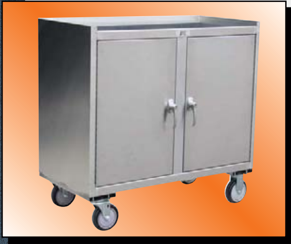
Model YW Shown