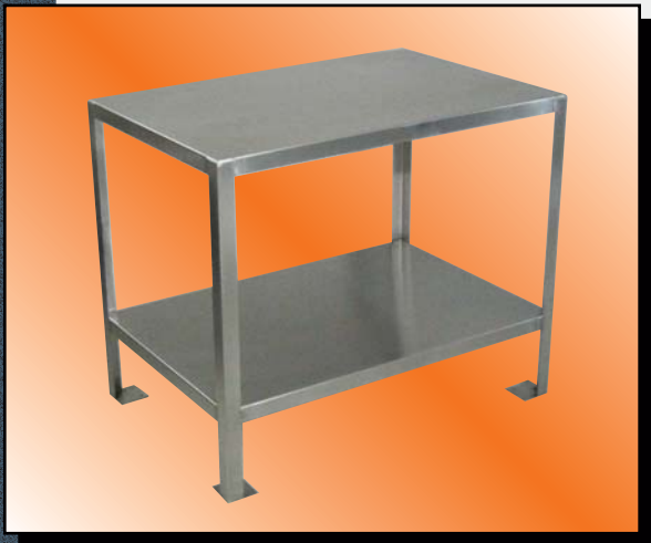
Model XW Shown