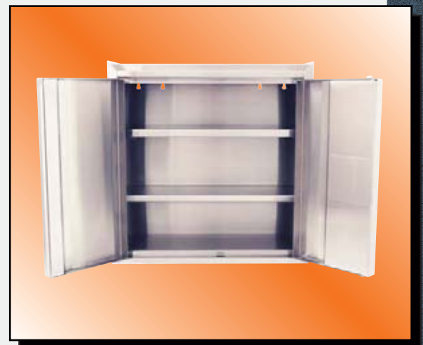
Model KS Shown