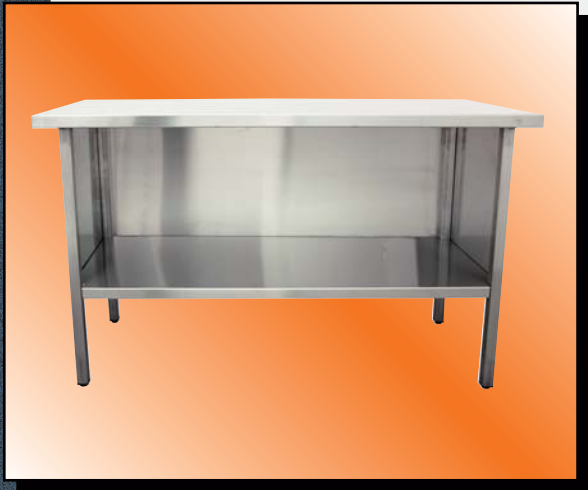
Model VN Shown