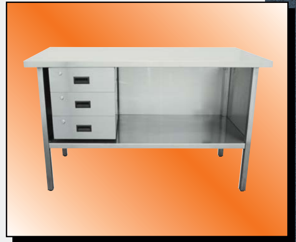
Model VP Shown