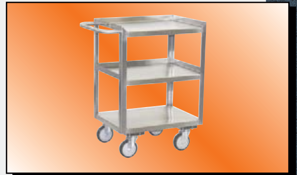
Model XV Shown