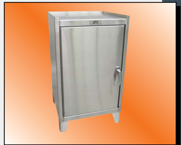
Model VY Shown