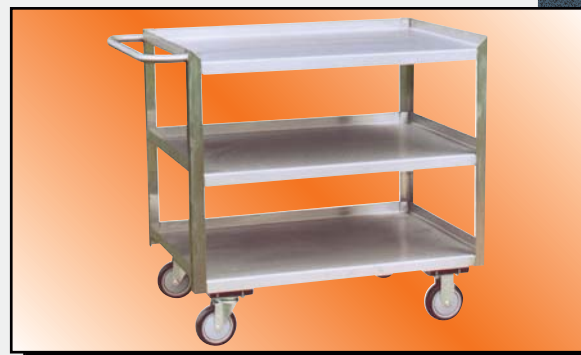
Model XY Shown