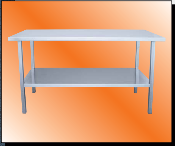
Model UK Shown