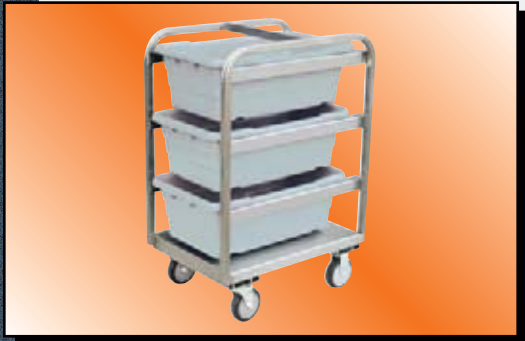
Model YH Shown