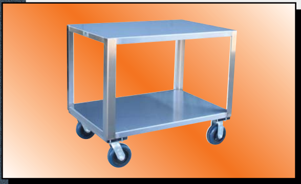
Model YM Shown