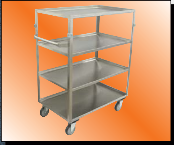
Model ZX Shown