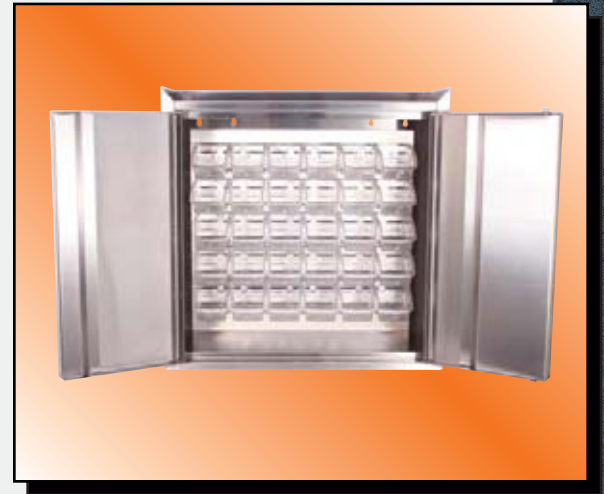
Model KP Shown