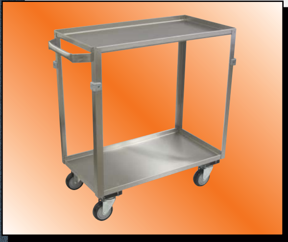
Model ZE Shown